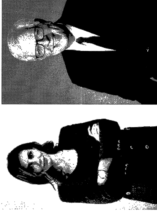
Atty Alina Habba (Left), Radio Host Dennis Prager (Right)